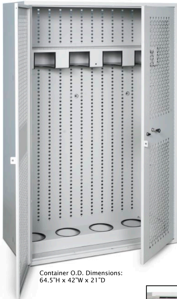
Container O.D. Dimensions: 64.5"H x 42"W x 21"D